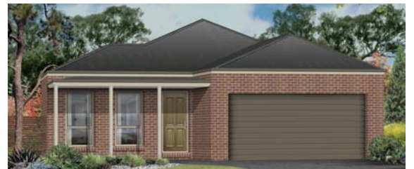
THE HAWTHORNE TRADITIONAL