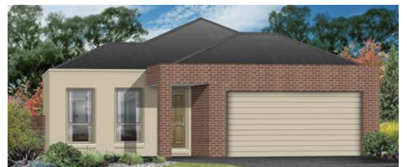
THE HAWTHORNE MODERN