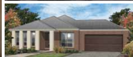
THE FELIX. MODERN