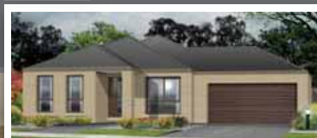
THE FELIX. CLASSIC