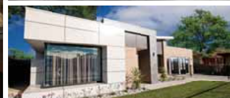
THE FELIX. CONTEMPORARY