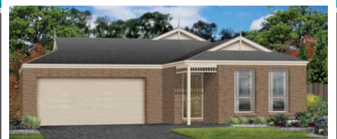
THE AVANTI COLONIAL