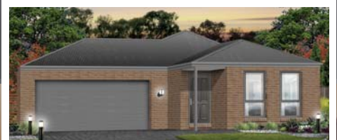
THE AVANTI CLASSIC