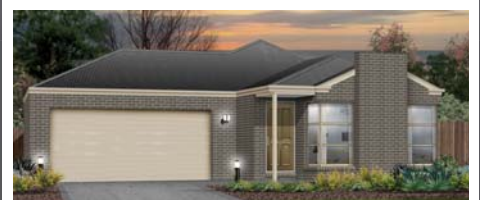
THE AVANTI CONTEMPORARY