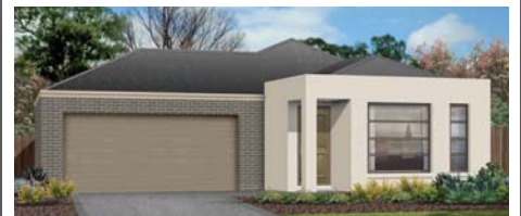
THE AVANTI MODERN