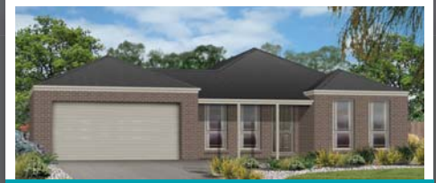
THE REGENCY COLONIAL