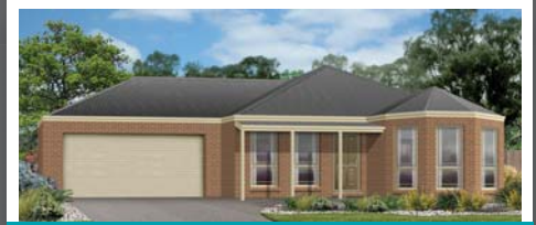
THE REGENCY TRADITIONAL